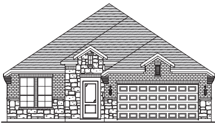
Elevation A (with stone)