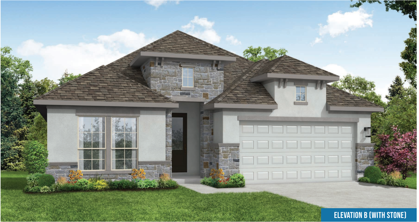
ELEVATION B (WITH STONE)