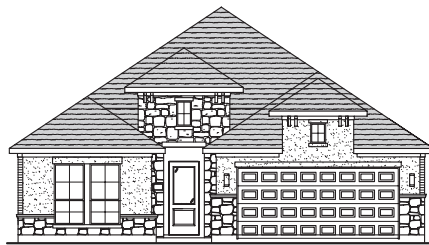
Elevation B (with stone)