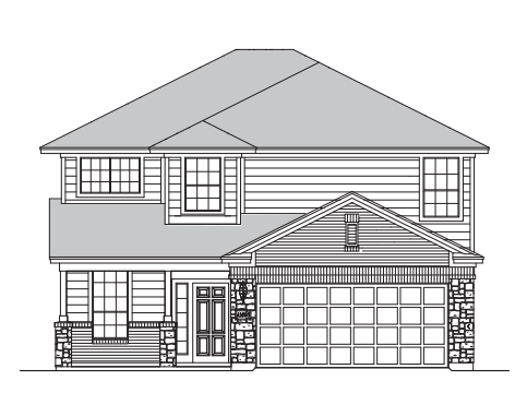
Elevation A (with stone)